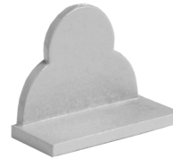
1805 Hanging Wall Shelf