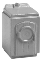
1809 Clothes Dryer