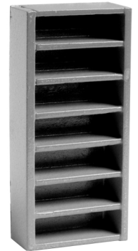
1800 Shelving Unit 7 Shelves