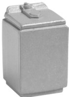
1808 Washing Machine