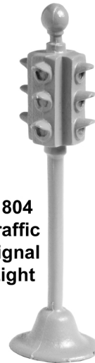
1804 Traffic Signal Light