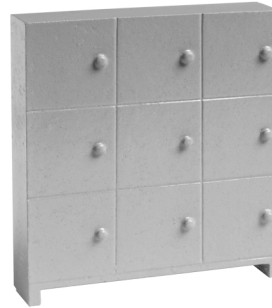
1798 Locker - 9 Door